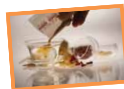
Eu Yan Sang TCM

Additional 10% off final bill for nett spending of $100 in a single receipt