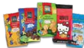
Taste Original (Organic Food)